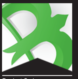
Product Code: CM1801