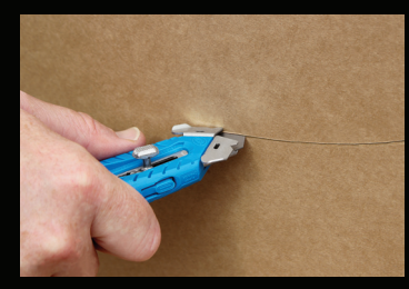
Tray Cut / Window Cut